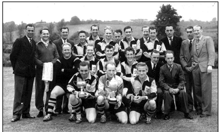
Northchurch Football Team, 1960