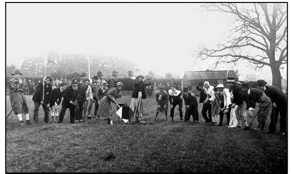
'A kind of cricket match', 1937

Plus a 'kind of a cricket match', quite a few years ago. (c1937)