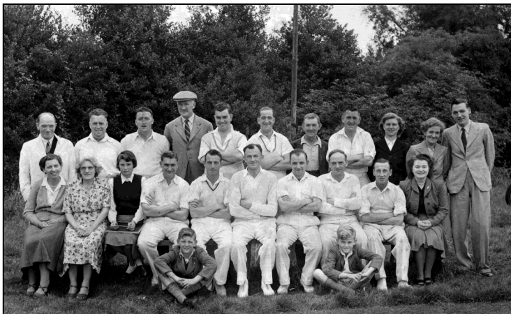
Northchurch Cricket Team, 1951