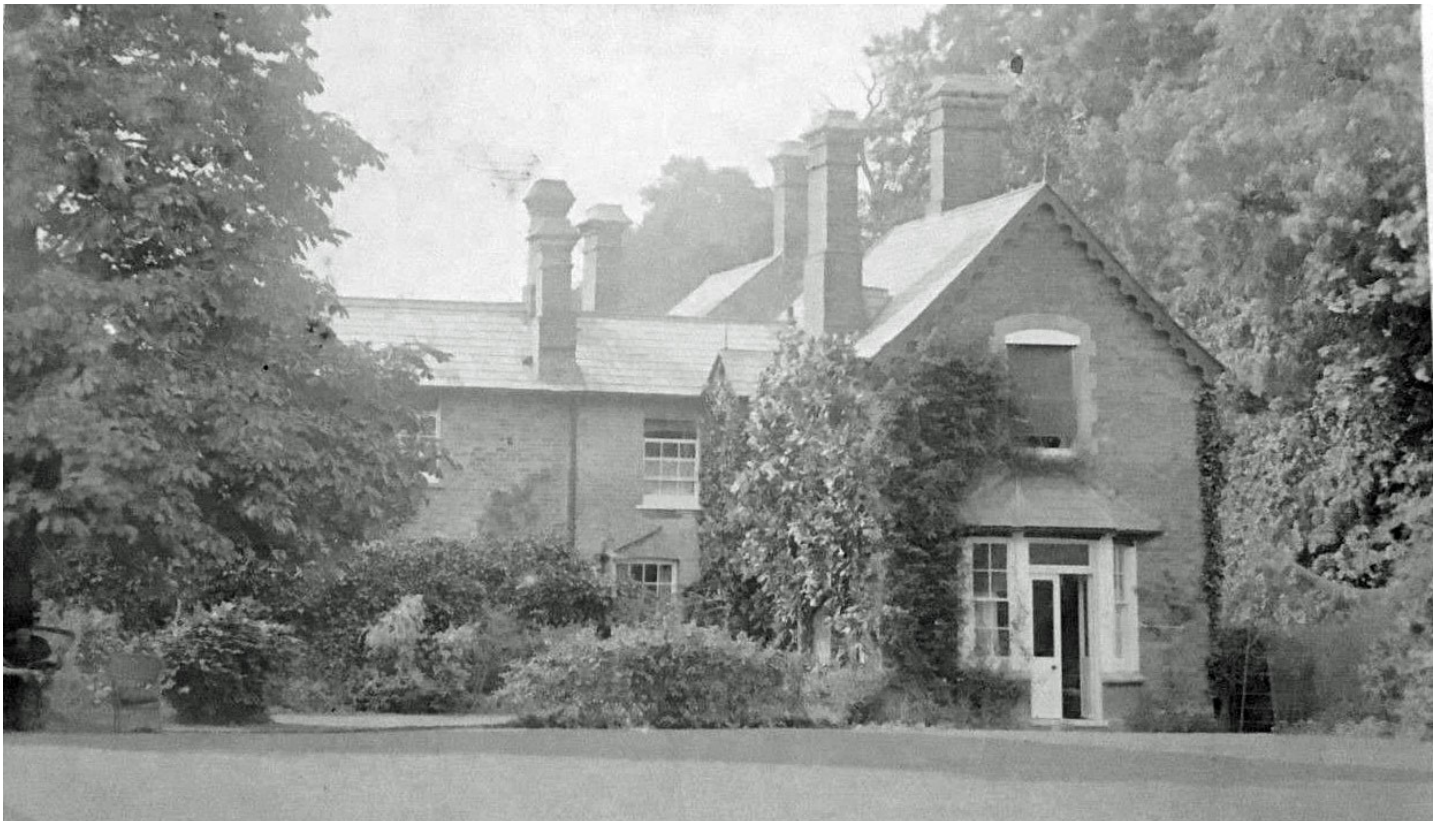
Box Cottage—now known as Northchurch Place.