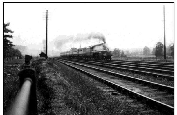
"The Coronation Scot" Dudswell Area