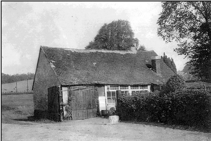
The Blacksmith's at Dudswell, 1934