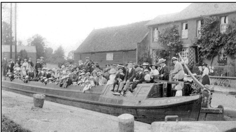
Sunday School Outing? Dudswell Lock, c1920